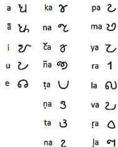
Fig (1) Vettezhutthu Script Chart

is one of twenty two scheduled languages in India, with rich literary heritage. Character recognition in Tamil language is more complex due to enormously large character set and high similarity between characters. The problem becomes more difficult to recognize the various centuries used by ancient Tamil peoples for Vattezhutthu alphabet. The Fig (1) shows the sample of Vettezhutthu alphabets.